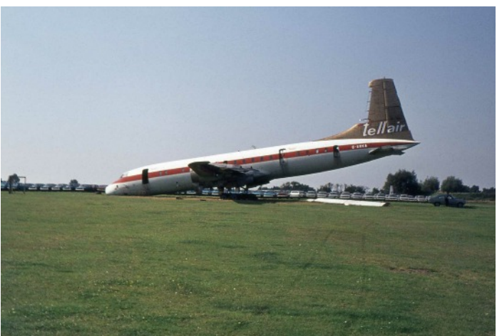
On Mark Marksman (Modified Douglas B-26) & Bristol Britannia about to be scrapped both in the later 70's early 80's