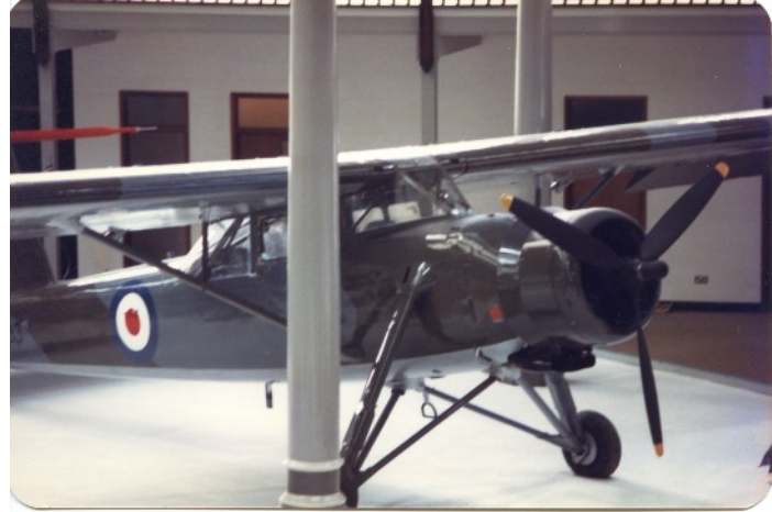
Fairey Firefly Cockpit & engine - Scottish Aviation Pioneer