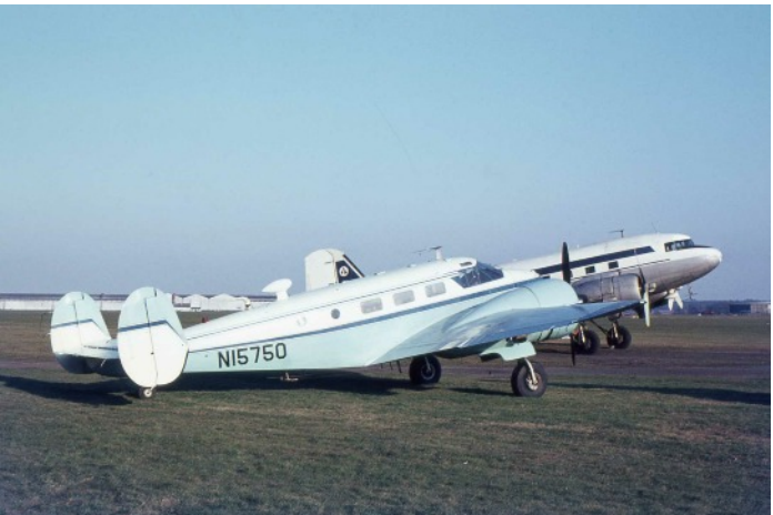
Constellation awaits the axe man & Beech 18 passes through both at Coventry.