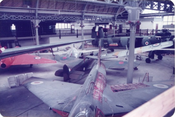
Swiss Air Force DH Vampire - General view of the gallery