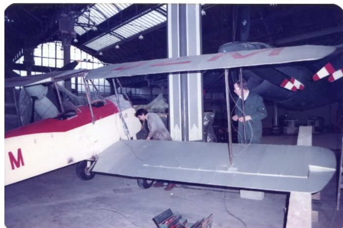
SPOT THE MEMBERS