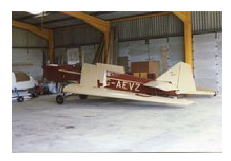
BA Swallow G-AEVZ will feature in the saved list and now based in Spain. Seen here at Redhill in Surrey,

Work on the Website progresses slowly, Facebook link has been added and Flickr. Please feel free to add comments to the Facebook site. Flickr will be used to record trips out and aeroplanes we own and have been saved by us.