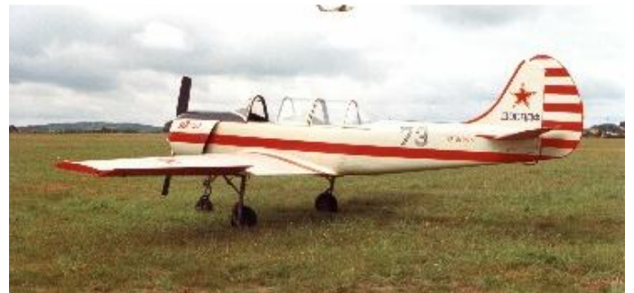
White Waltham 1990s