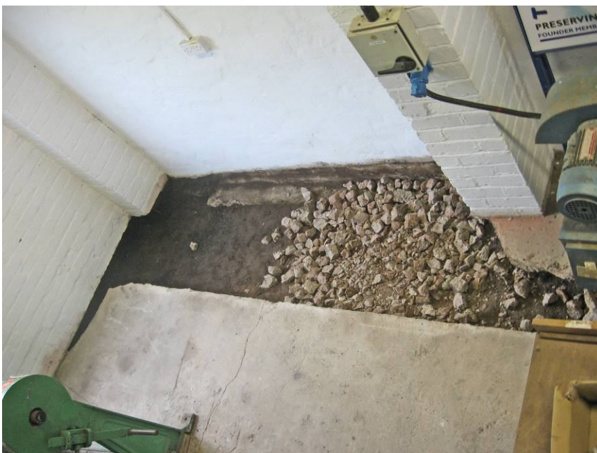
This photo shows the far right hand corner of the floor in hut 28, Stewart and I have removed the Badly damaged concrete and several inches of ash and earth. Rubble is being used as a base followed by a mixture of sharp sand and stone, this will be followed by five inches of concrete. The old floor was just two inches of a very sandy looking mix, this and the roof of the annex are our priority projects this summer.