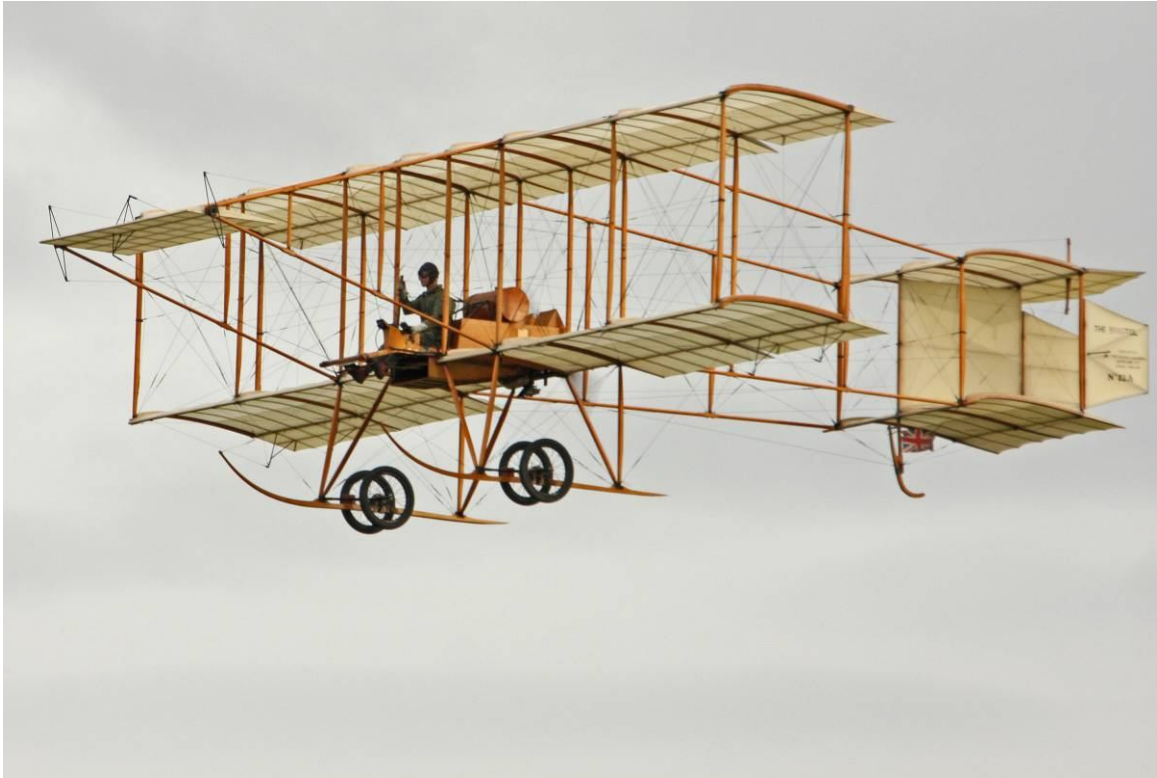
Two pictures from Old Warden taken during the September Air Show 2012, the Bristol Boxkite above and below the Avro Triplane, imagine making and fitting all those wires !!