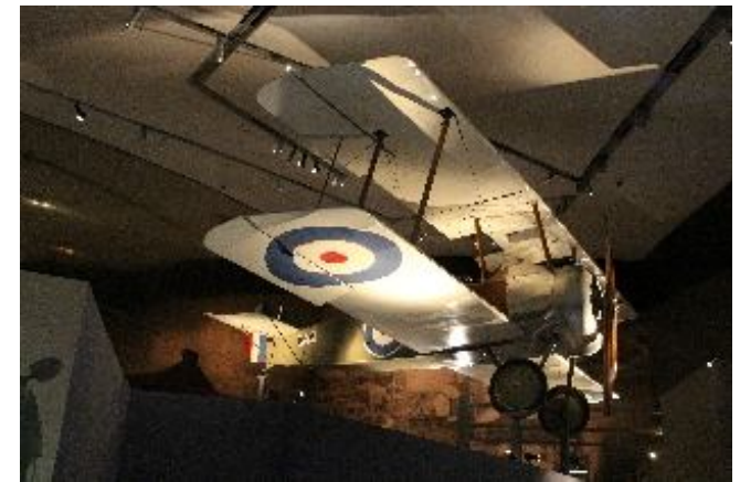
Sopwith Camel Taken At Imperial War Museum North