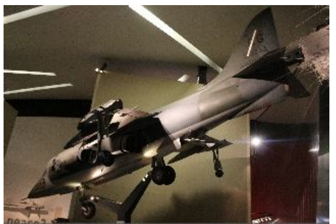
McDonnell AV8 Taken At Imperial War Museum North