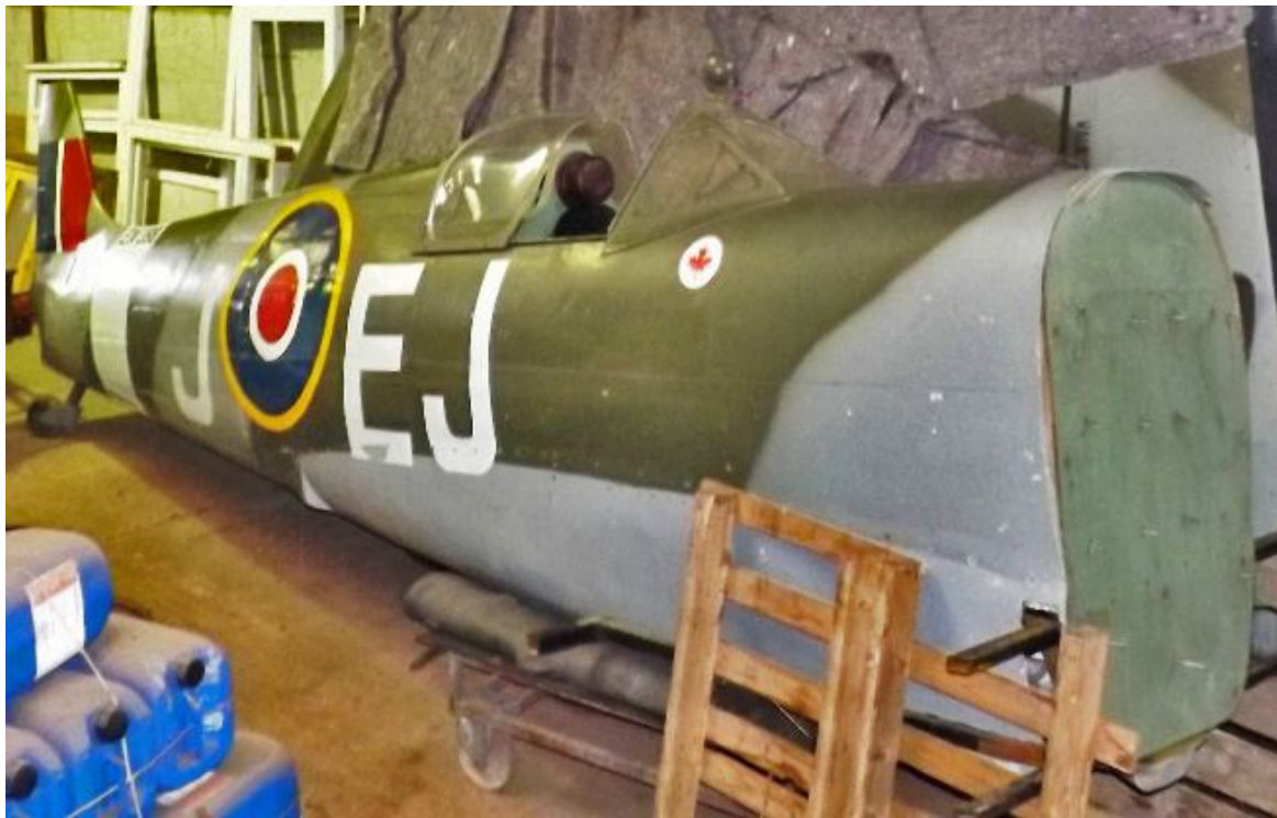
FSM Spitfire MK. IX EN398 JE-J

These photos taken in February during a visit to check on her condition show her to be in fairly good nick. Yes she has some minor damage needing repairs and a repaint to bring her back to the condition seen on the front cover.