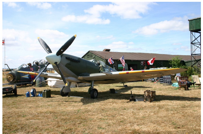
Supermarine Spitfire Replica at Sleep Aerodrome