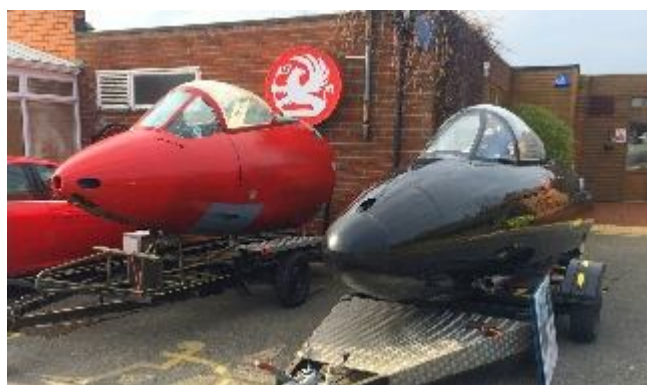
Sea Hawk and Hunter Cockpits at Griffin Trust Aviation Fair, Vauxhall Motors Social Club