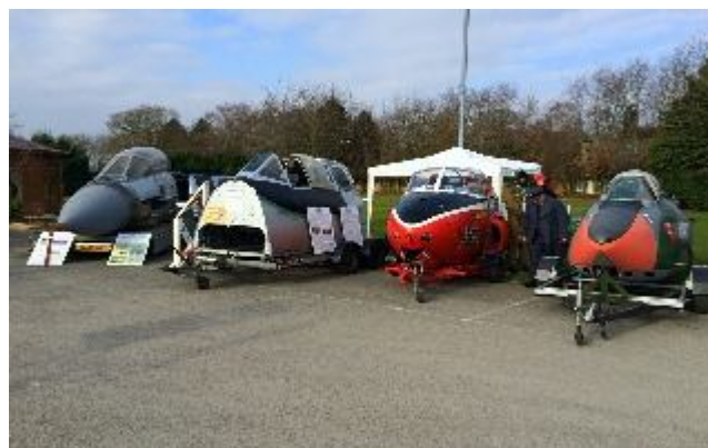
Tornado, Gannet, Jet Provost & Venom Cockpits at Griffin Trust Aviation Fair, Vauxhall Motors Social Club